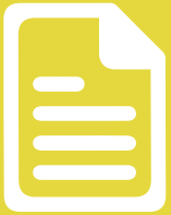
Time & Attendance